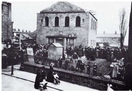
Demolition of Central Methodist Chapel, which had been built in 1846 opposite the Mechanics' Institute

In 1822 two cottages in Dixons Fold, Kerry Hill were converted into a small chapel which became known as "Ranters Fold" – Ranter being the nickname of Primitive Methodists because they would return home singing loudly and praising the Lord.